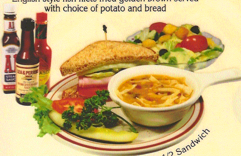
Soup, Salad & 1/2 Sandwich

English style filets fried golden brown served with lemon and tartar sauce